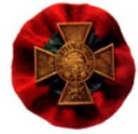
The Defenders of Lvov Cross